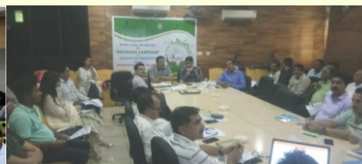
Jammu and Kashmir