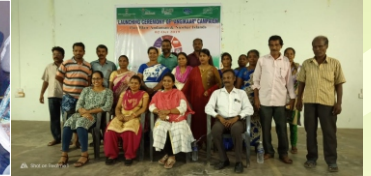
Andaman & Nicobar Islands