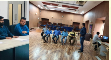
Daman & Diu