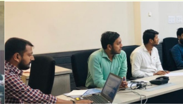
Dadra & Nagar Haveli