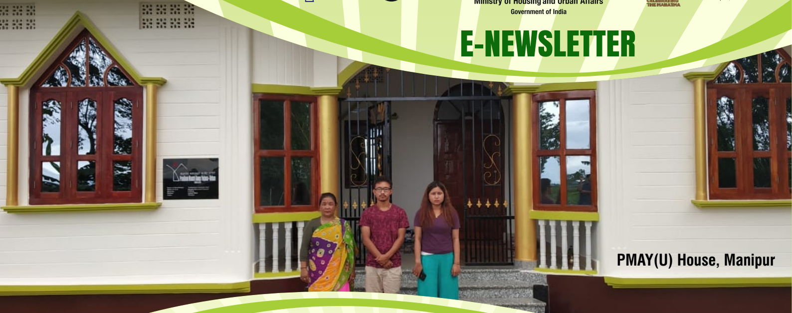
PMAY(U) House, Manipur